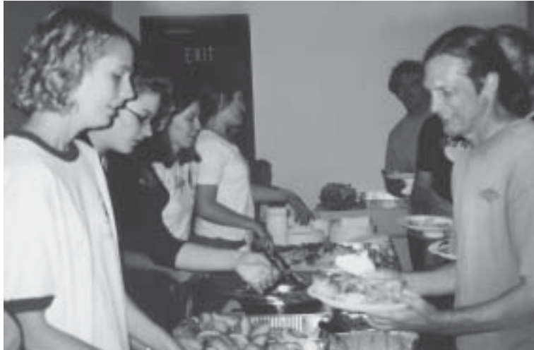
CAB volunteers serve Thanksgiving dinner to Isla Vista homeless

During fall quarter, UCSB students participated in many new fund-raising events, such as the 9/11 Twin Tower